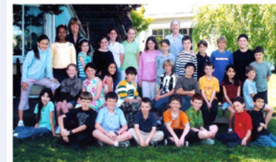
Planning Heals Communities

Join OTM, IGS and Horizon's Athletes for Environmental Cause: